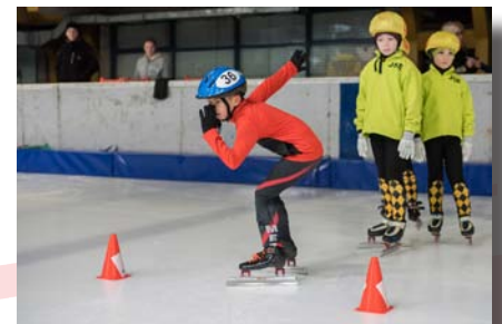
Serbia Open 2018. skill races